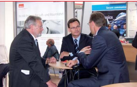
Hamburg Senator of Economic Affairs, Axel Gedaschko, visiting the Hanse-Aerospace stand at the ILA 2008