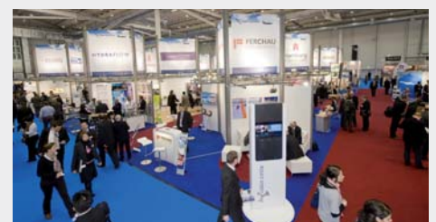
At Aircraft Interiors Expo, the Hanse pavilion will again be the largest trade fair stand with 1069 m 2 of space and 75 exhibitors present