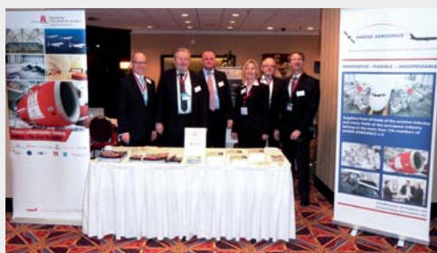
Delegation participants visiting Montréal